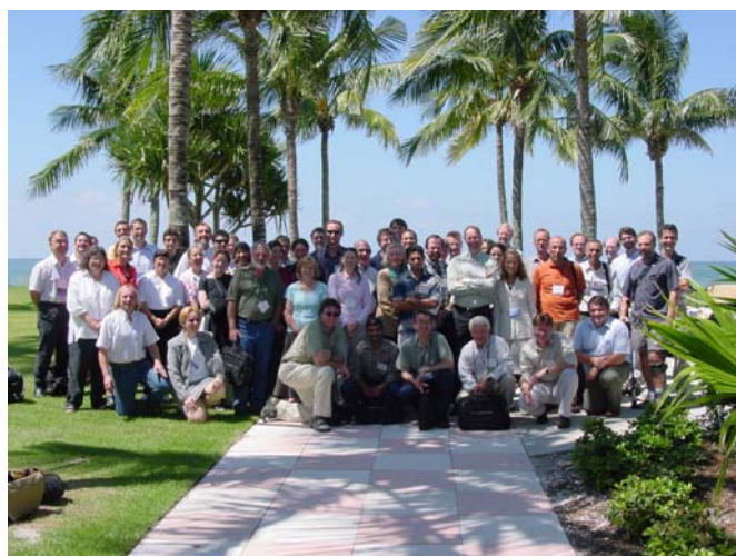
Fig. 2. Participants - Pedometrics 2005 meeting in Naples, Florida.