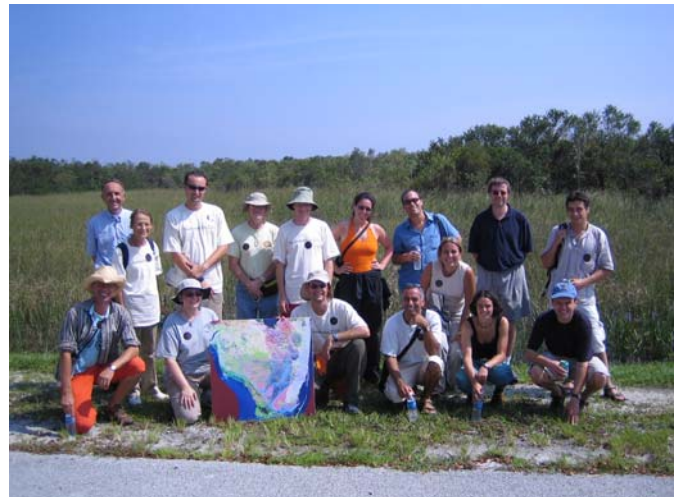
Fig. 8. On tour in the Florida Everglades.