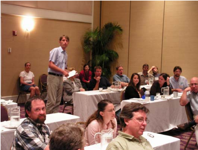
Photo: The discussion is warming up.

This brings me to the hottest topics of Pedometrics 2005. Although it is not easy to group and sort various conference presentations and topics, I think that there were (at least three) groups of topics in Naples that seem to be especially hot. These are: