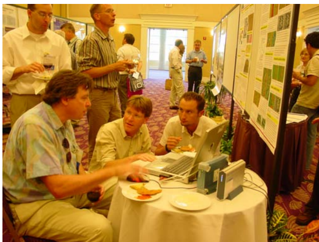
Fig. 5. Poster session - Pedometrics 2005 meeting.