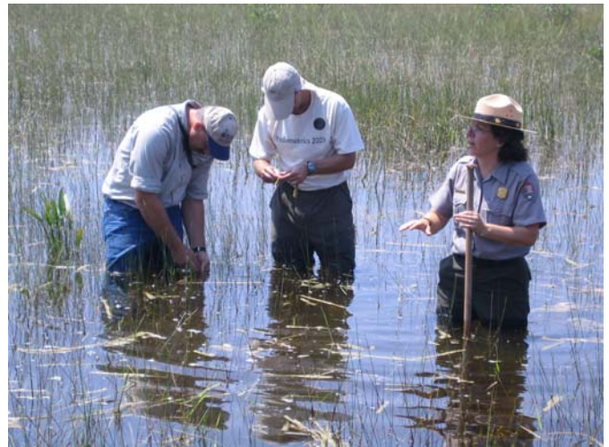
Fig. 7. Mapping of wetland soils - post-conference tour, Greater Everglades.