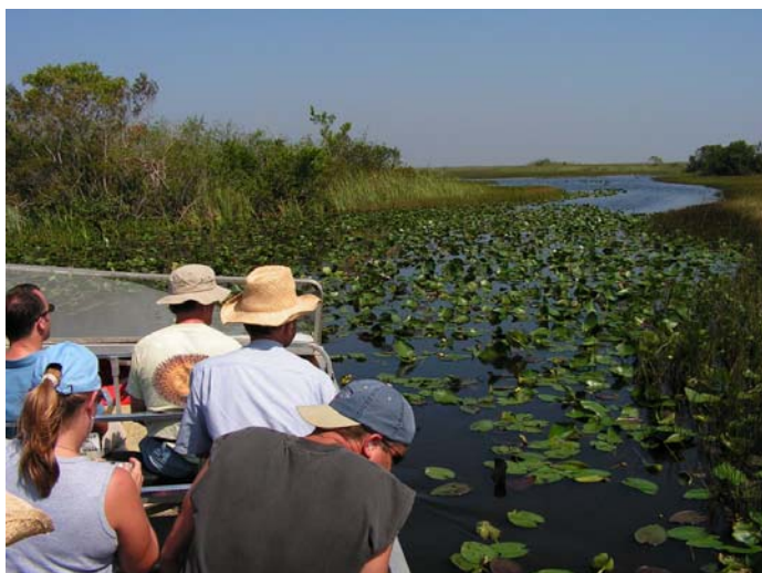
Photo: The Everglades tour.

Following up some of my points above, I will try to give some suggestions to the organizers of future pedometrics-related conferences (Germany, China):