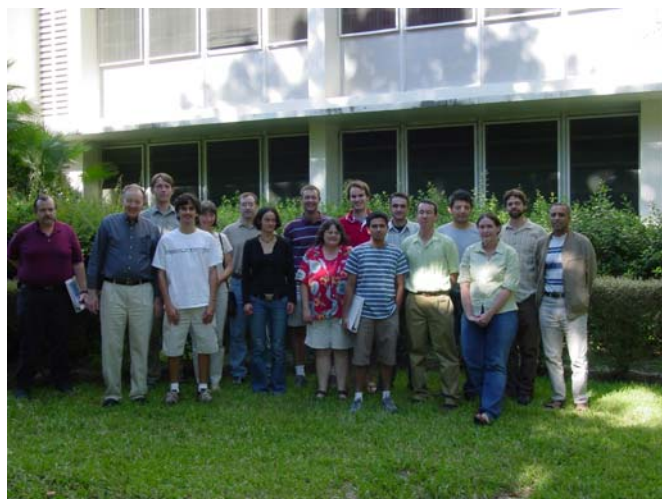
Fig. 1. Pre-conference workshop participants.