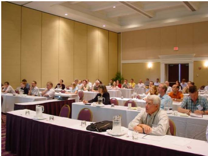
Fig. 4. Pedometrics conference, Naples, Florida, 2005.